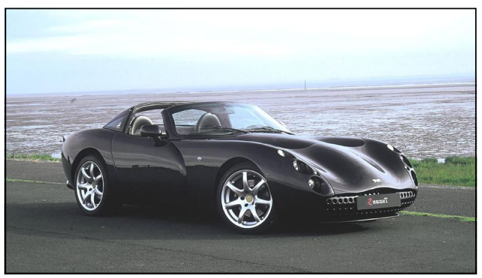
TVR These plastic cars from Blackpool can go quite fast, when they are running.